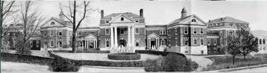
UNIVERSITY OF VIRGINIA HOSPITAL

Female Patients: Parson's Pavilion, Historic, Warren Men's Services: Reardon Ambulatory Services: Outpatient Clinic Women's Services: Reardon Mission Services: Outpatient Pavilion The Pavilion: Treatment